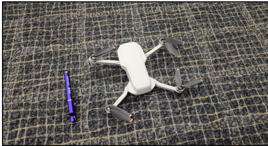
(a) Category A1 SUA